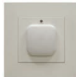
Indoor and Outdoor Enclosures